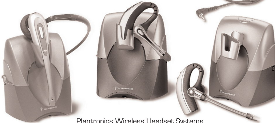
Plantronics Wireless Headset Systems