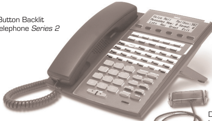
DSX 34-Button Backlit Display Telephone Series 2